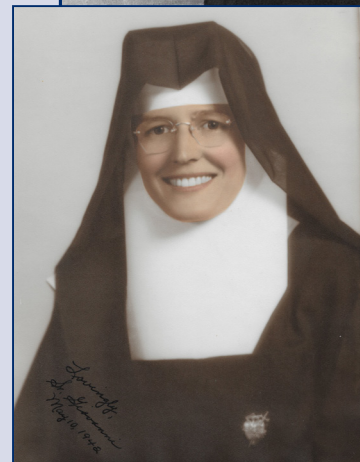
TOP AND ABOVE: Newly professed!