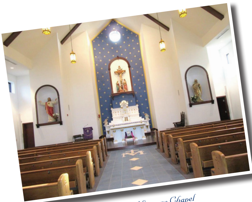
Our Lady of Sorrows Chapel

Praise God from Whom all blessings flow!