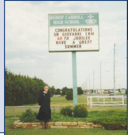
TOP: How she loved teaching!