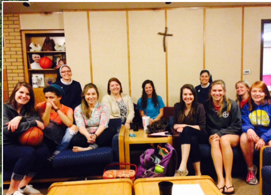
OPPOSITE PAGE: Holy Saturday Vigil with Our Sorrowful Mother