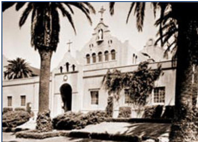
1: Early photo of the California IHM's Hollywood Motherhouse