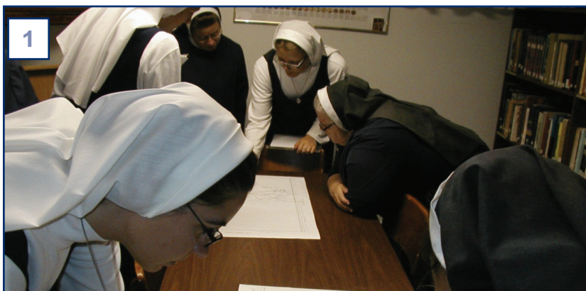
1: Sisters looking at different versions of a master plan, discussing the pros and cons of each