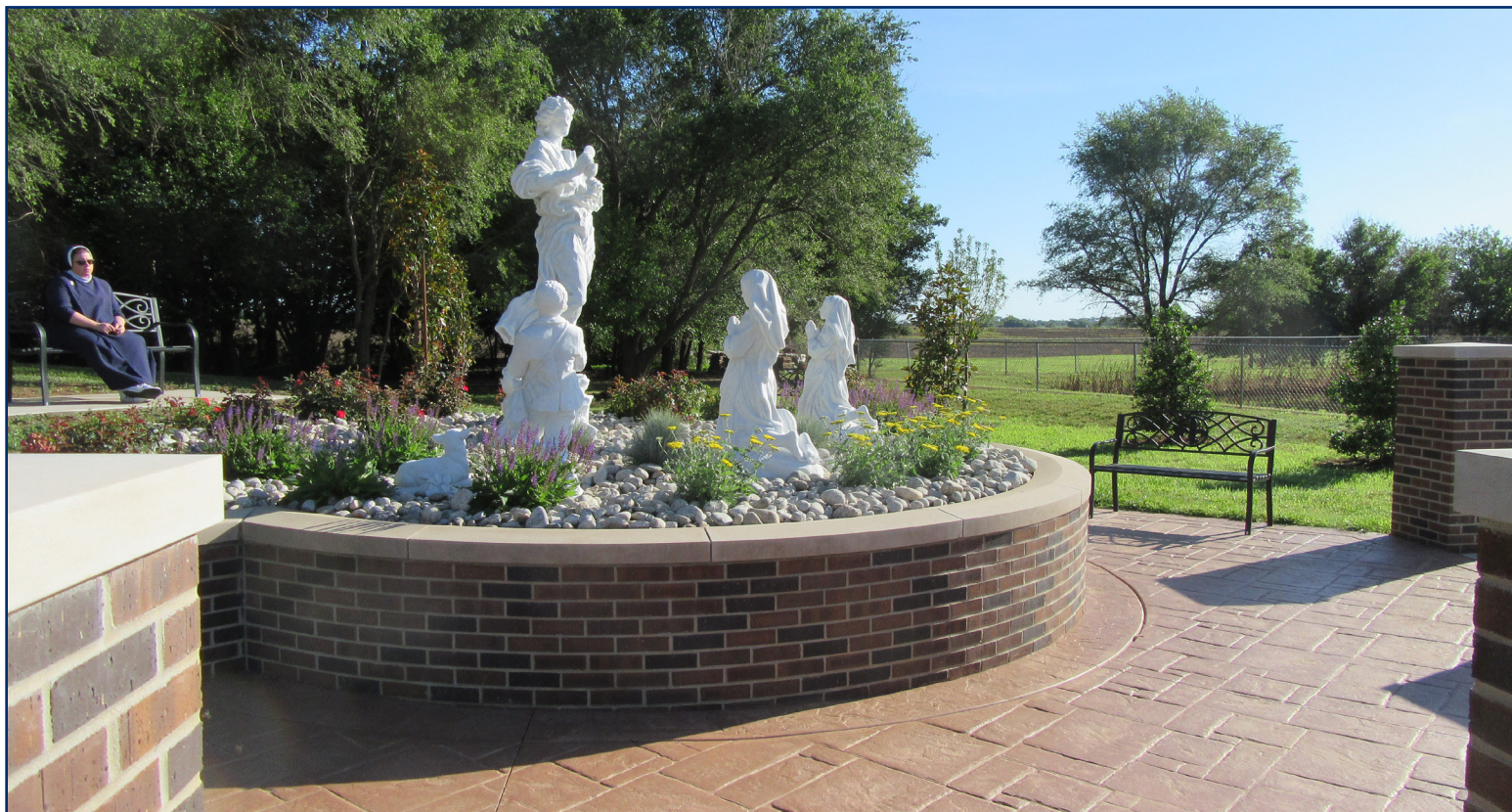
The Fatima Angel shrine after the landscaping and benches were added.

Outrages refer to serious acts of blasphemy and dishonor in regards to the Holy Eucharist. This can refer to the satanic profane use of the Eucharist, desecration of the Holy Eucharist by those who vandalize or destroy Churches and their tabernacles, or even the blatant disregard of consecrated Hosts that are found on floors, pews, or in other areas of Catholic Churches after Mass. Reparation for these offenses consists of acts of adoration, love and faith to make up for the dishonor shown to the Eucharistic presence of Jesus. (AA 40)