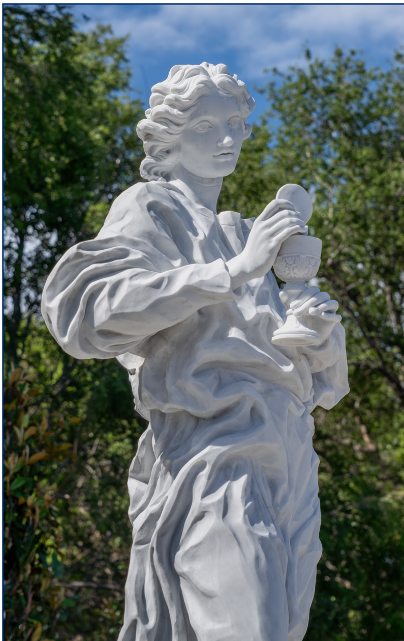
Detail of the statue of the Angel of Peace.

In May of 1917, three children were tending their families' flocks in the Portuguese countryside when suddenly they saw a beautiful Lady descend from heaven. After talking with her and asking questions, the Lady, before departing, asked them to return to the same location at the same time for the next six months. Those familiar with this story will know that I am referring to the approved apparition of Our Lady of Fatima.