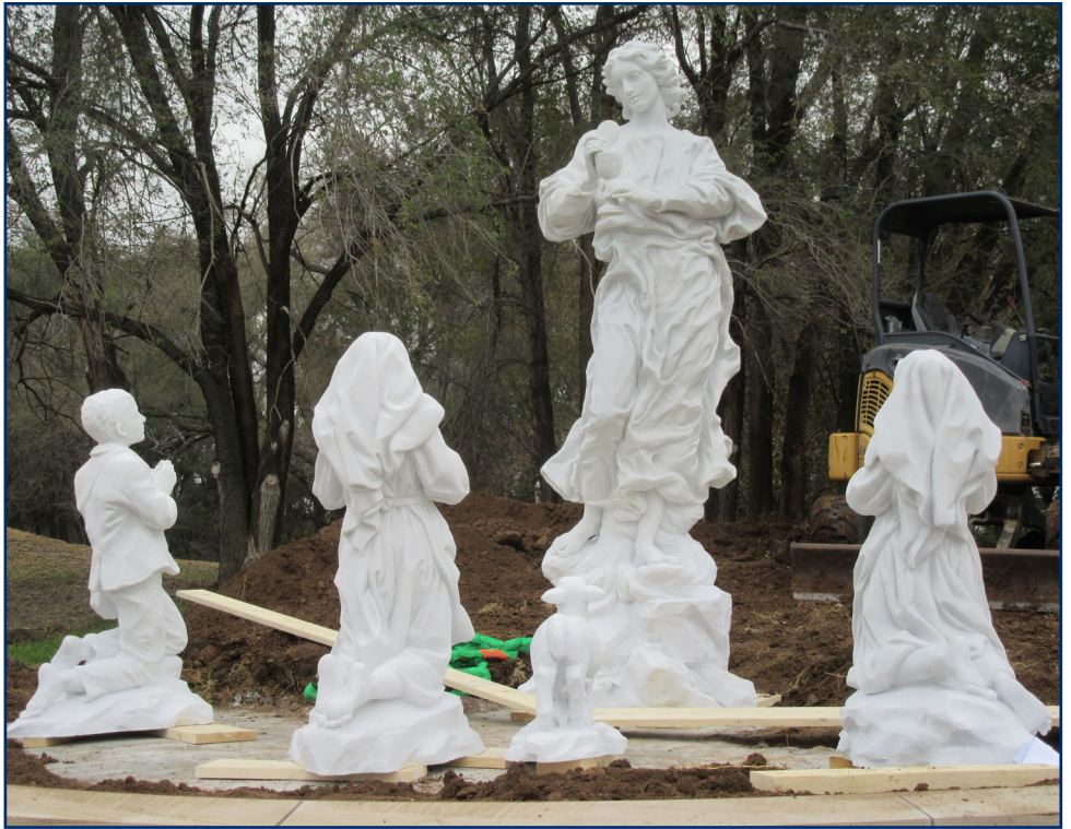
The group of statues were arranged in preparation for their installation.

The iconography was strictly based upon the writings of Blessed Lucia who described the angel as appearing after a strong wind with bright light, and his drapery resembling a brilliant diamond 2 . How can cloth be carved to look like diamond? It cannot be smooth or generalized so I attempted to delineate movements with multifaceted folds. The projection of light is also associated with fire; which in this case is represented with curvilinear rhythms, suggesting the liveliness of burning flames.