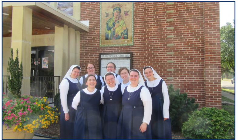
CLOCKWISE FROM TOP LEFT: St. Mary, Derby; St. Mary, Oxford; Our Lady of Perpetual Help, Wichita; Our Lady of Lourdes, Pittsburg NEXT PAGE: Cathedral of the Immaculate Conception, Wichita