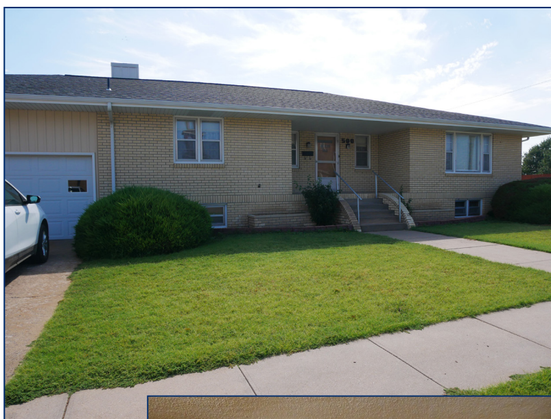
TOP: The outside of Holy Family Convent in Hays, KS.

Our Lady provides a beautiful example in her response to God’s call: “Behold, I am the handmaid of the Lord. Let it be done to me according to thy word.” Mary always let herself be led, repeating her “Fiat” in each new circumstance, responding to the graces of the present moment. Let us echo her unconditional “Fiat” and follow her advice with loving trust: “Do whatever He tells you.”