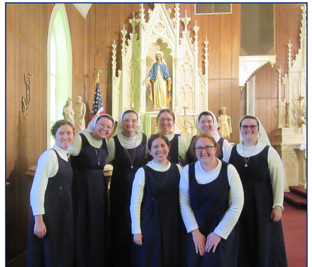
TOP: St. Mary, Aleppo

We cannot better the divine decision to link Mary to the salvation of the world! It was the wondrous decision of Our Lord to do so, for our advantage. She helps us in innumerable ways, first through her intercessory power which is second to none. She also nurtures within us our own sanctification, showing us how to imitate Jesus and bringing us into intimate communion with Him. Now in heaven, reigning as Queen at the right hand of Jesus Our King, she is not only our advocate and protectress she also shows us what God desires for us: to be with Him in heaven for all eternity.