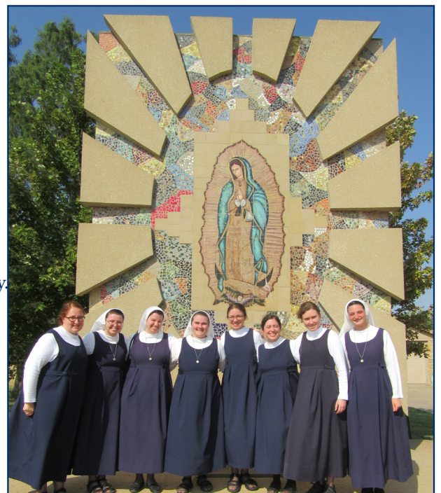
BOTTOM: Our Lady of Guadalupe, South Hutchinson