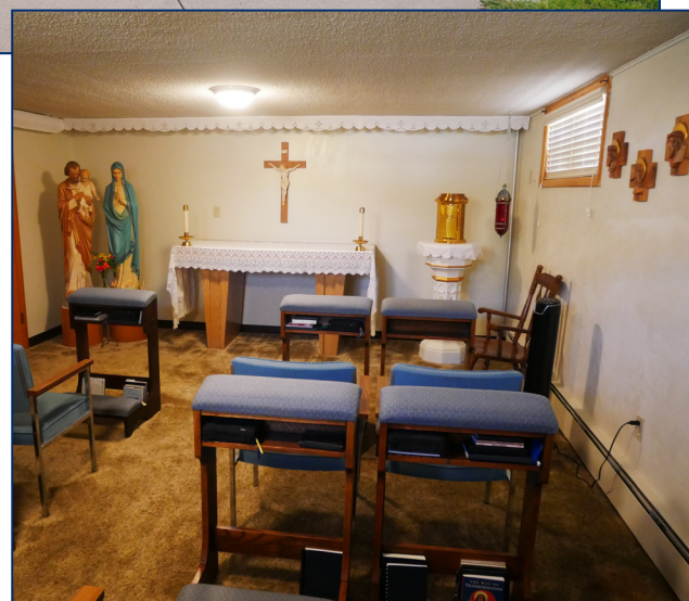
BOTTOM: The Chapel in Holy Family Convent.