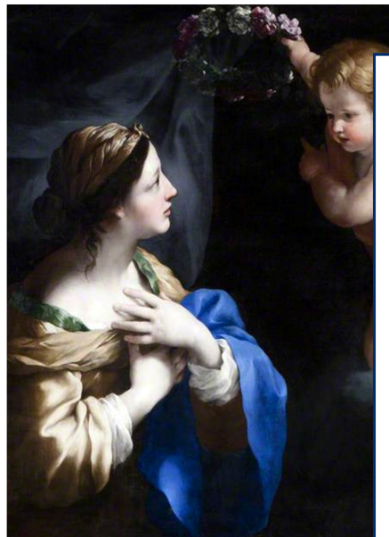
Saint Cecilia Virgin and Martyr