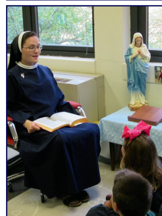
The Sisters are missing their students!