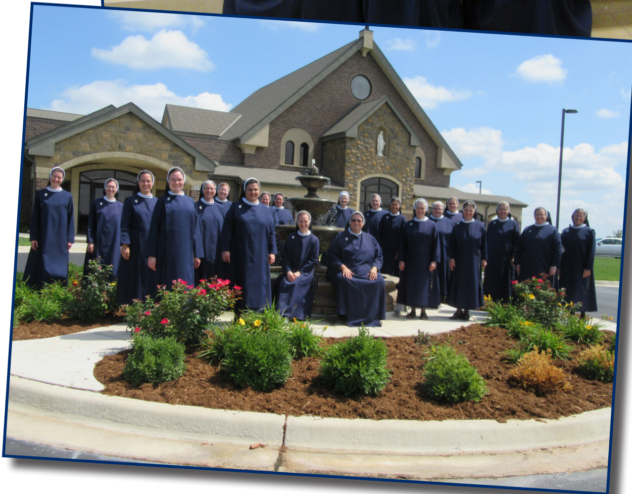
TOP: Our novices and postulant send their cheerful, prayerful greetings.