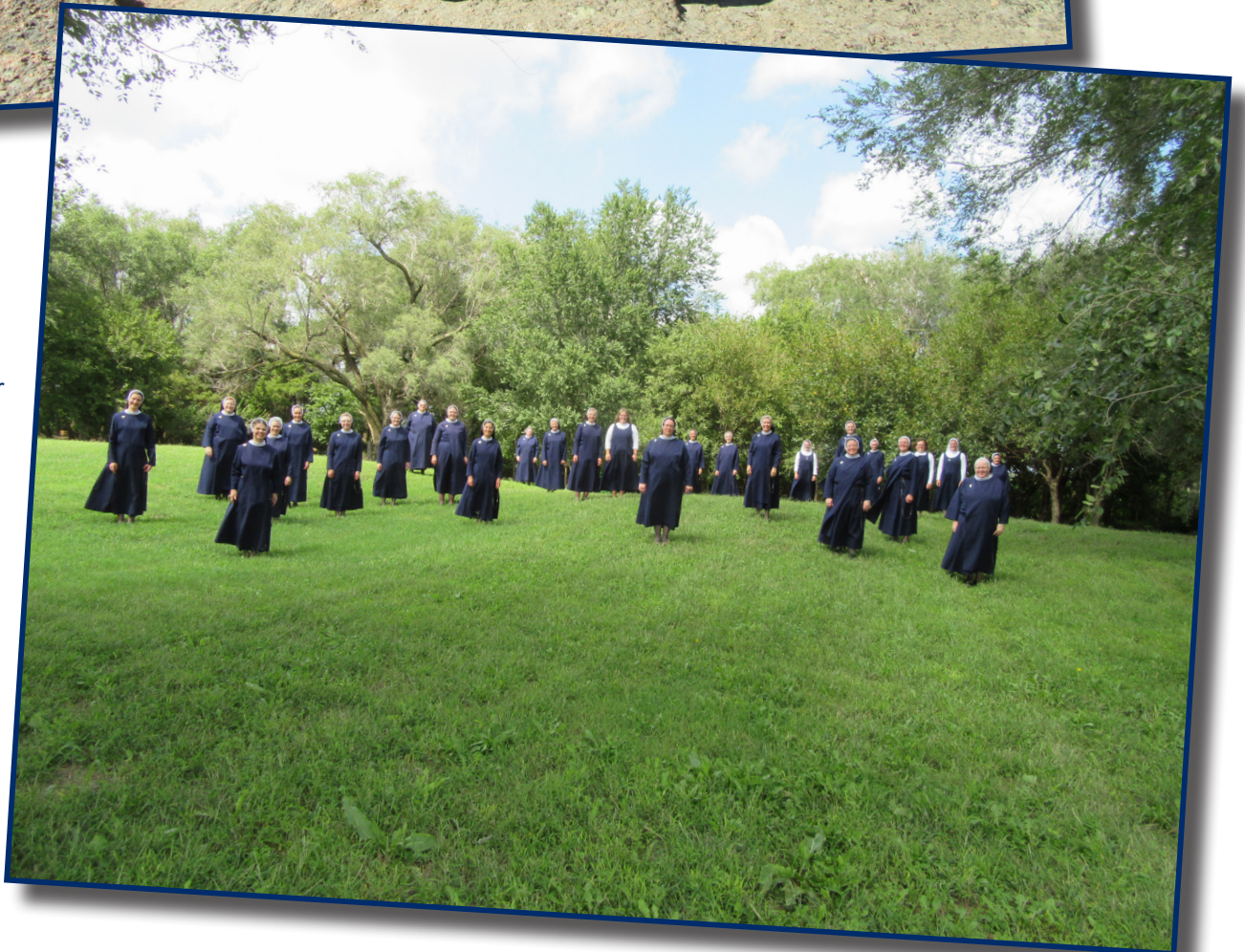
Bottom: The Community gathered for a photo on their Motherhouse property.