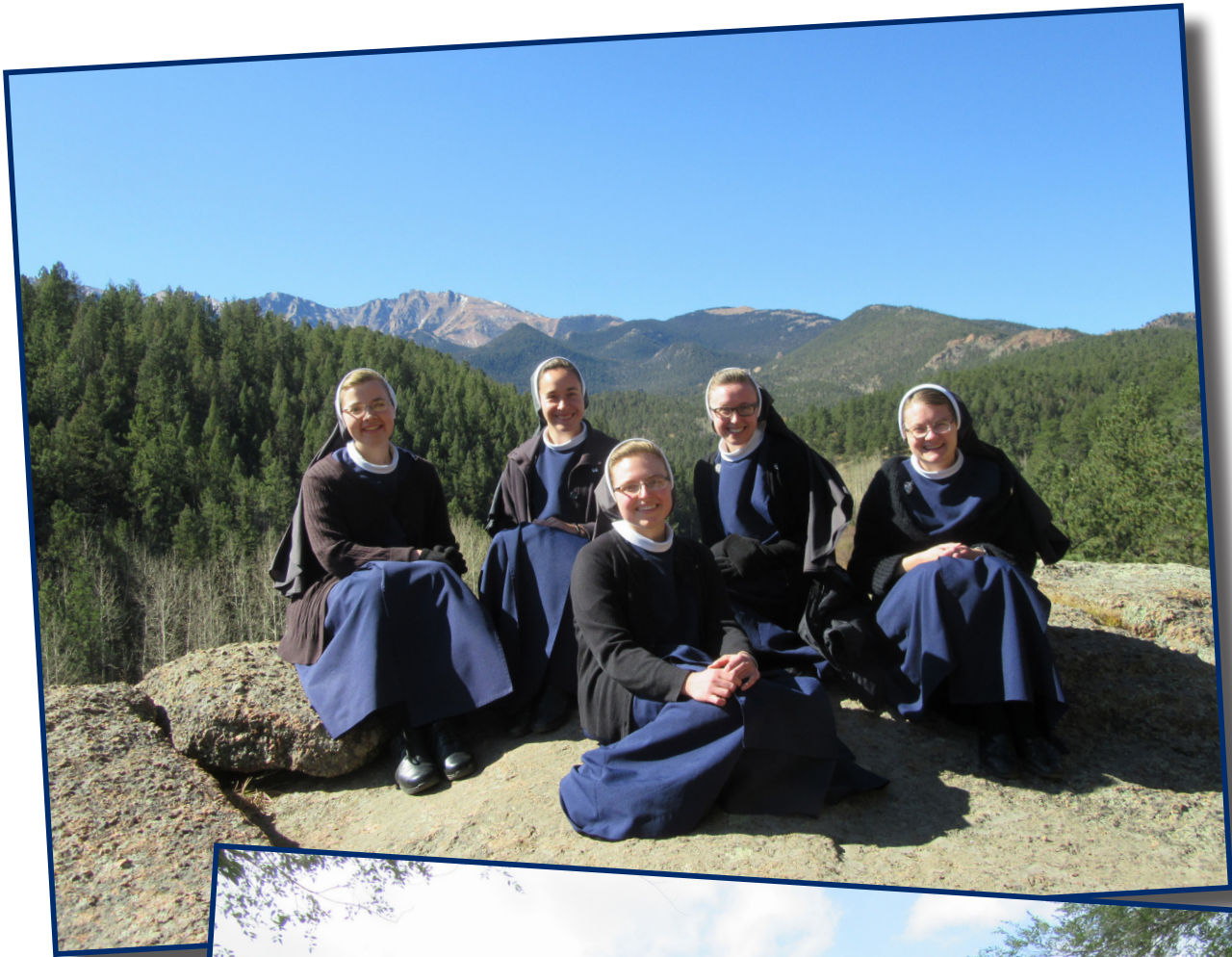
Top: The First Professed stop for the view and a photo on the way to the top of Pike's Peak.