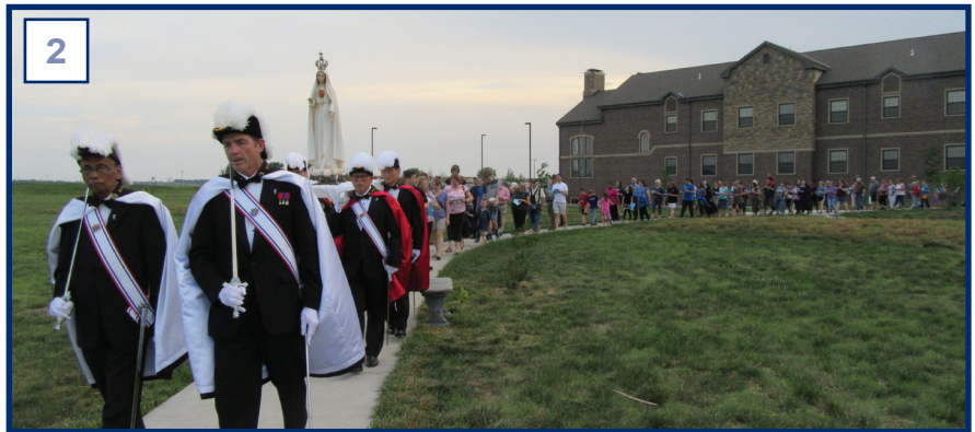
1: The 11th semi-annual Our Lady of Fatima procession begins on an absolutely picture perfect day! The Knights of Columbus again added to the solemnity and prayerfulness of the occasion.